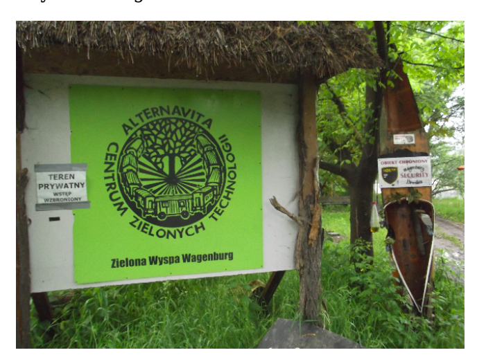
Image 7: Sign at Wagenburg, Wrocław. Addition to the left reads: "Private area. No trespassing."

by the law these people could come with police [and a locksmith], so in this way the police could go inside [and] we don't want them [to], of course. So we decided to go by the law ... and to let [the city officials] in ... We are thinking that ... behaving in that way we can stay here longer.