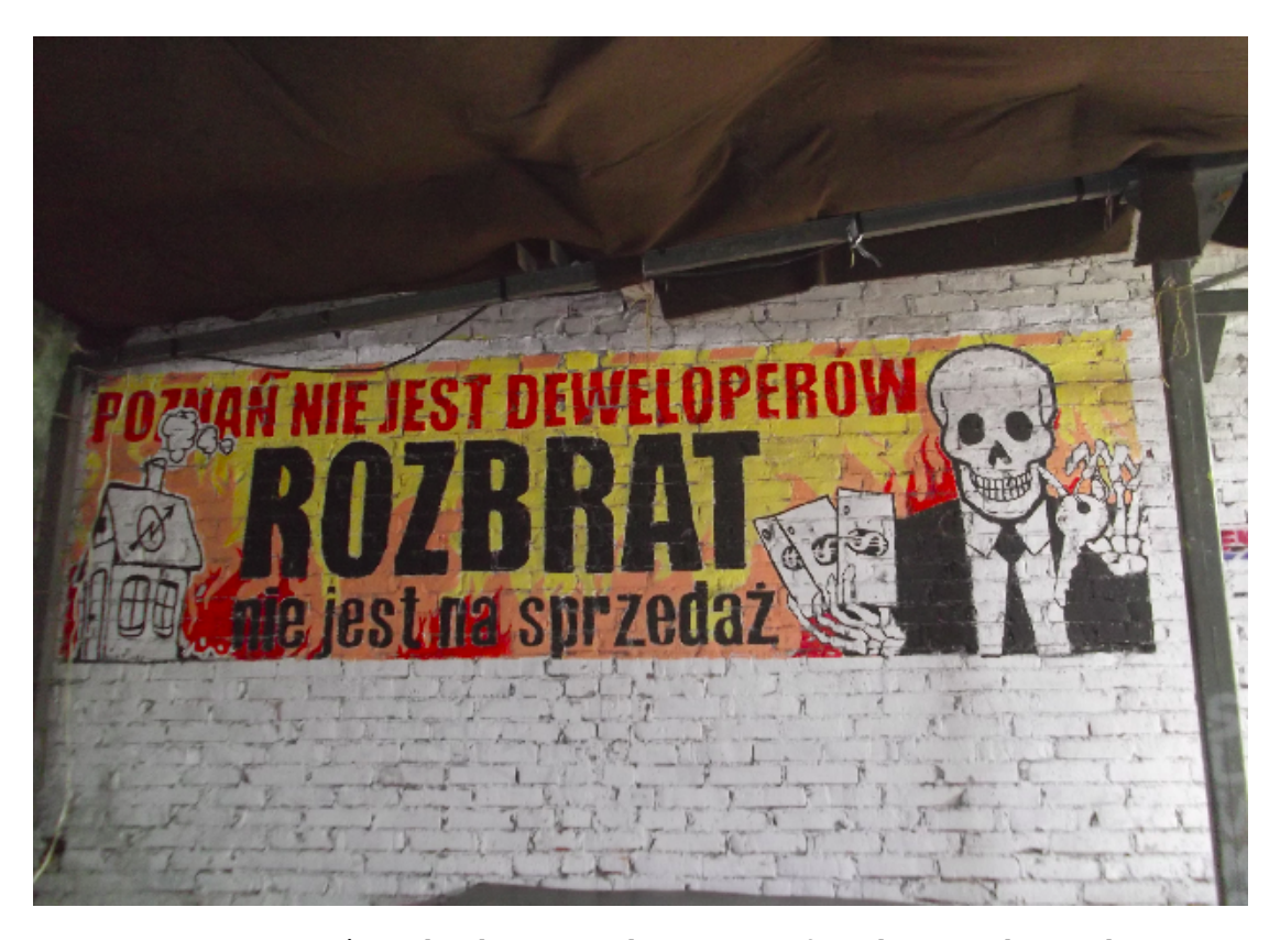
Image 6: "Poznań not developers. Rozbrat, it's not for sale." Mural at Rozbrat