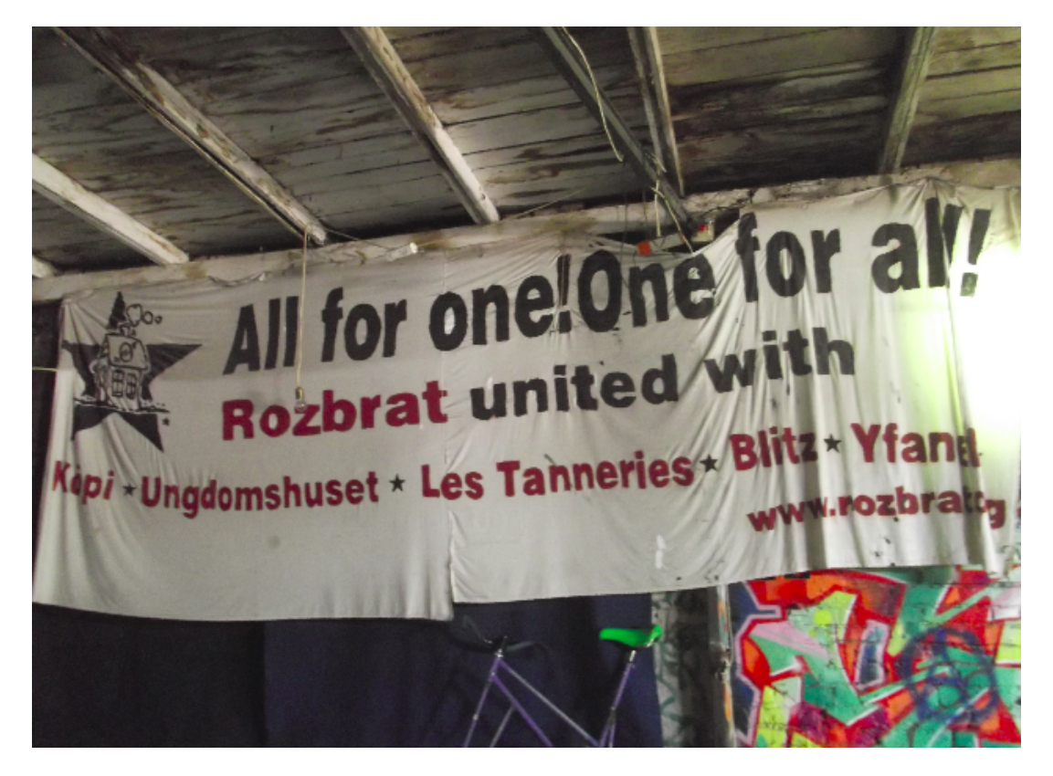
Image 5: Banner at Rozbrat in solidarity with Köpi (Berlin), Ungdomshuset (Copenhagen), Les Tanneries (Dijon), Blitz (Oslo), Yfanet (Thessaloniki)