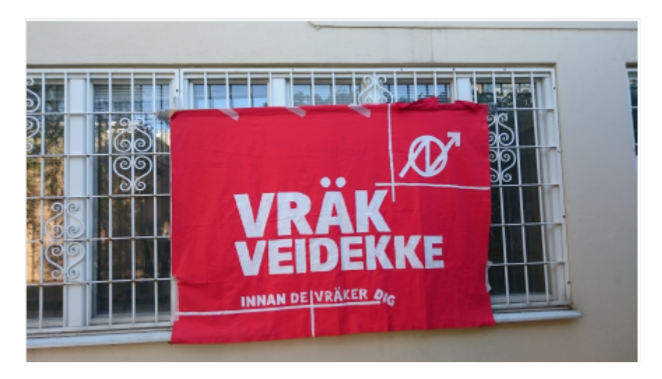
Figure 1. A banner stating "Evict Veidekke before Veidekke evicts you" from the Högdalen's People's House, May 2015.

In Stockholm, one of the most well-known social centers in the 2000s was Cyklopen . It started with squatting an empty building in 2003 and developed into an established social center in Högdalen from 2013 onwards (Brand 2004/1; Ordfront 2012/3). In Umeå, different squatting events aimed at creating free/autonomous spaces, even if the framing and methods varied from case to case and were intertwined with a critique of local (housing and cultural) politics (Lundstedt 2016).