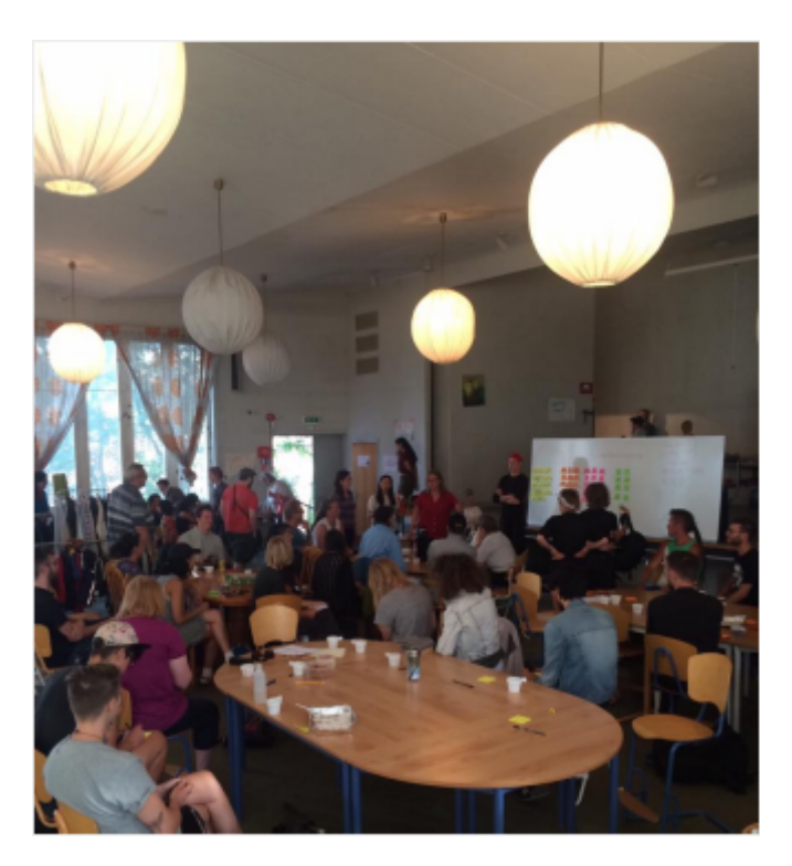
Figure 3: Squatted school building in Hagsätra, south of Stockholm, June 2016.

These kinds of motives for squatting, increasing in the 2000s, were usually framed as a critique of the cutbacks in the welfare state, privatization of formerly public companies, market-orientation, and an increased focus on profitability. The squatting groups used the slogans of "Reclaim the welfare" (Documentary"Anarkistiska Kliniken 4") or "We didn't create the crisis. We don't want to pay" (<a href="https://lundabormotnedskarningar.wordpress.com/">https://lundabormotnedskarningar.wordpress.com/</a>).