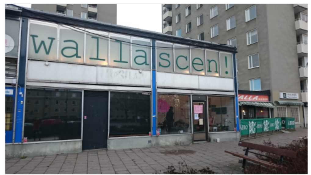
Figure 2: Squatted theater in the district of Årsta, south of Stockholm, November 2015.

Reaction to closure and suppression of a particular activity/sector was also found to be a significant motivation for the squatting undertaken during this more recent period. One of the longest occupations driven by this motive was the over three-year-long occupation of a local hospital in Dorotea, threatened to significantly cut down its activity in the area (SR 2015-01-30). Also, other social and cultural community centers threatened by re-location or closing chose to squat their facilities in protest (such as Järvas Vänner in Akalla, which protested in 2015 against civil society organizations being thrown out from the premises, Lundabor mot nedskärningar (Residents of Lund against cutbacks). Other examples include Lund in 2009, reacting to the closing of an after-school center, Romano Trajo, residents of Husby protesting against a re-location of their community center to smaller premises in 2012, or the protest against changes planned by the municipality in the activities held in the cultural center Kulturhuset in Jönköping in 2014. One of the representatives of the network Järvas Vänner (Friends of Järva), occupying the premises that they formerly rented, explained the situation in 2016: